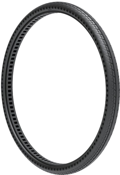
客户定制 Custom specifications