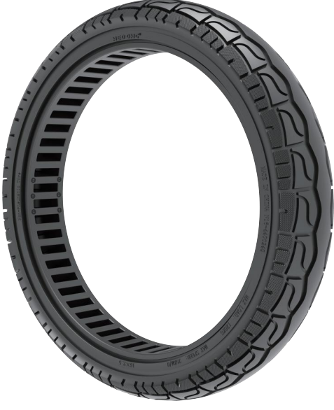
16x2.5 线蜂窝Line honeycomb