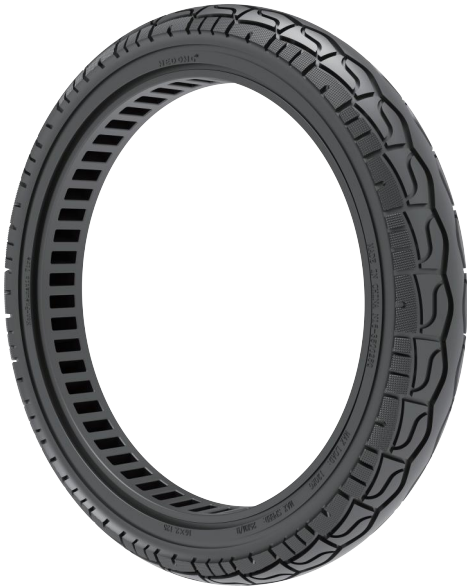
16x2.125 线蜂窝Line honeycomb