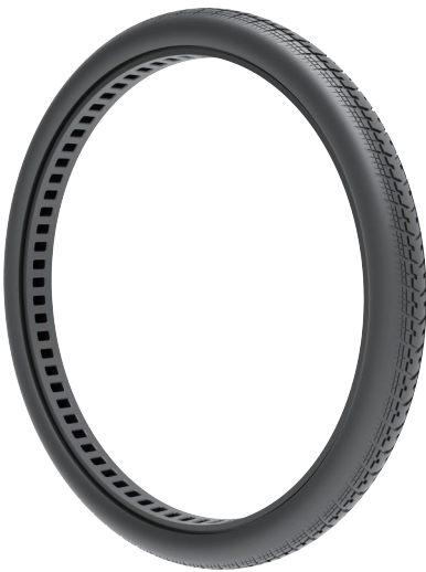
20x1.75 单蜂窝Inner Honeycomb