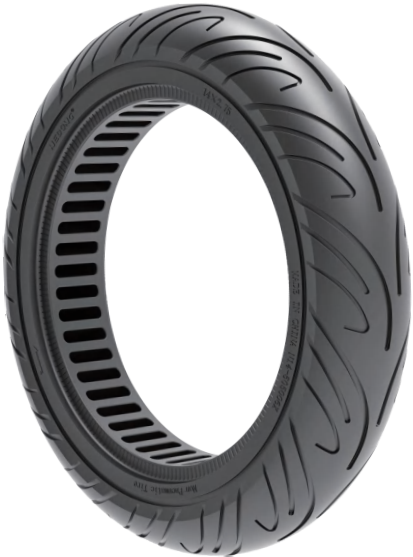
14x2.75 线蜂窝Line honeycomb