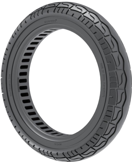
14x2.5 线蜂窝Line honeycomb