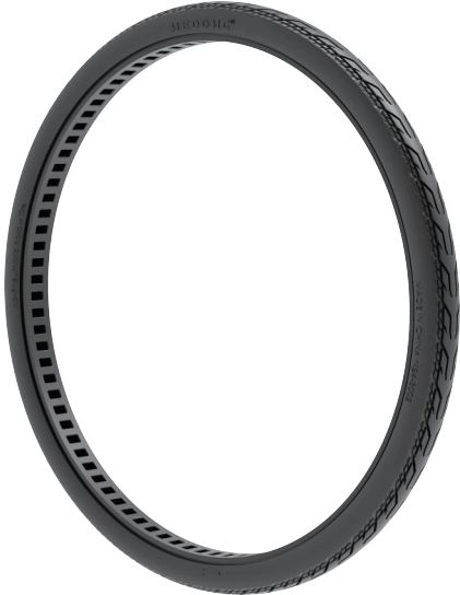
24x1.5 单蜂窝Inner Honeycomb