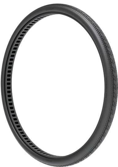
26x1.75单蜂窝 Inner Honeycomb