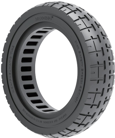
12x2.75 线蜂窝Line honeycomb